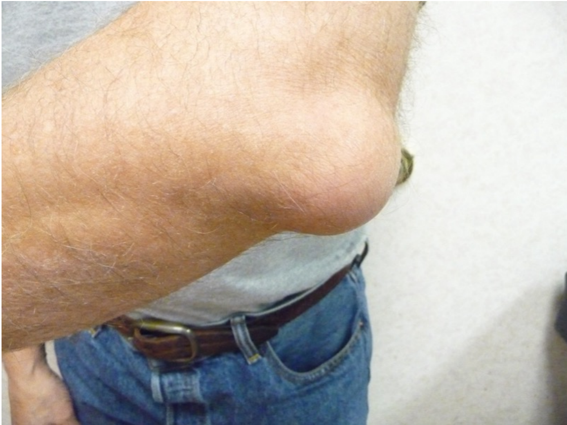
Fig. 1. Olecranon bursitis presents as a fluctuant, well-demarcated swelling/lump simulating a goose egg or golf ball.

Clinically, olecranon bursitis presents as a fluctuant, well-demarcated swelling/lump simulating a goose egg or golf ball over the olecranon process in the posterior elbow area (Figure 1) . 1,2