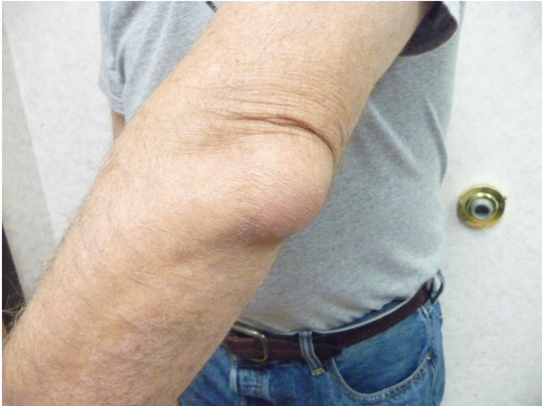
Fig. 2. Full elbow range of motion is generally preserved in septic and non-septic olecranon bursitis.

History of immunodeficiency/immunosuppression and physical findings of fever (temperature > 37.8^{\circ}\text{C} ), olecranon bursal warmth (temperature difference \geq 2.2^{\circ}\text{C} between the affected bursa and contralateral bursa), tenderness over the swelling/lump ( Figure 3 ), and nearby skin lesions (e.g., cellulitis, wound) suggest septic olecranon bursitis. 3