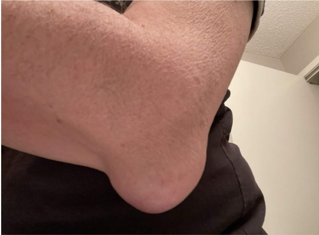
Fig. 3. History of immunodeficiency/immunosuppression and physical findings of fever, olecranon bursal warmth, tenderness over the swelling/lump, and nearby skin lesions suggest septic olecranon bursitis.

Underlying medical conditions such as rheumatoid arthritis and gout favor non-septic olecranon bursitis. Erythema of the overlying skin occurs in 63% to 100% of cases of septic bursitis and 25% of patients with non-septic olecranon bursitis, respectively. 8