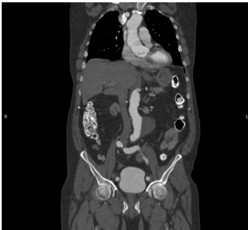
Figure 1. A computed tomography angiogram of the chest, abdomen, and pelvis revealed a 6.2-cm infrarenal abdominal aortic aneurysm with a mural thrombus with no evidence of rupture.

Results of a physical examination showed a patient in no acute distress.